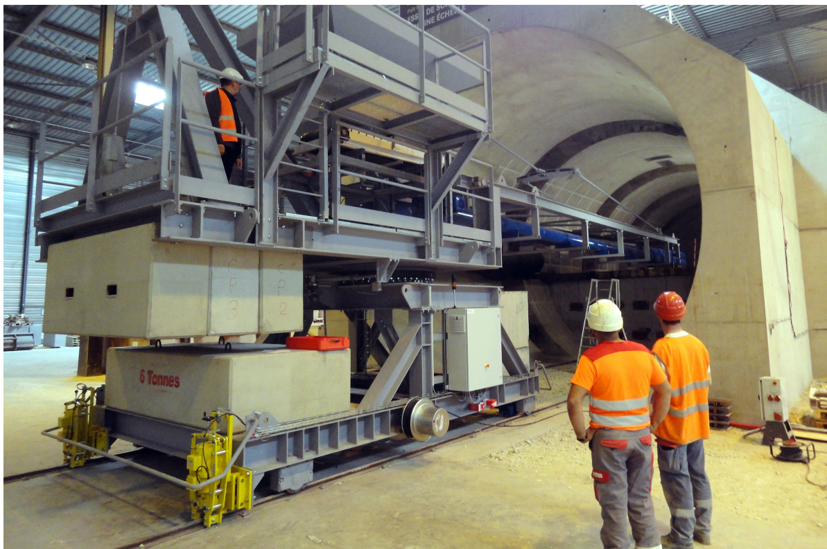
FSS test: Bentonite materials emplacement machine to be used for the construction of the swelling clay core.