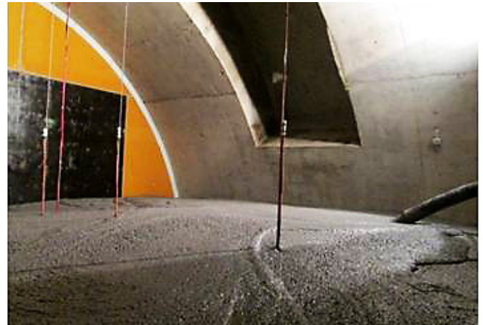
Casting of low pH concrete plug for the containment wall

August for bonding operations). This will be documented in Deliverable D3.11 (Report on FSS cast concrete plug construction.)