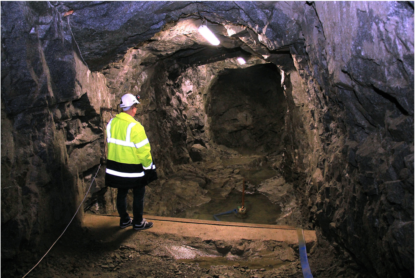
EPSP plug location before rock improvement phase.