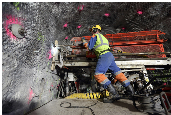
POPLU Drilling of monitoring boreholes.

location and aid in water tightness. The location for POPLU Experiment in demonstration tunnel 4 was selected based in the rock suitability classification (RSC) method developed by Posiva and the results were reported in Deliverable D3.26