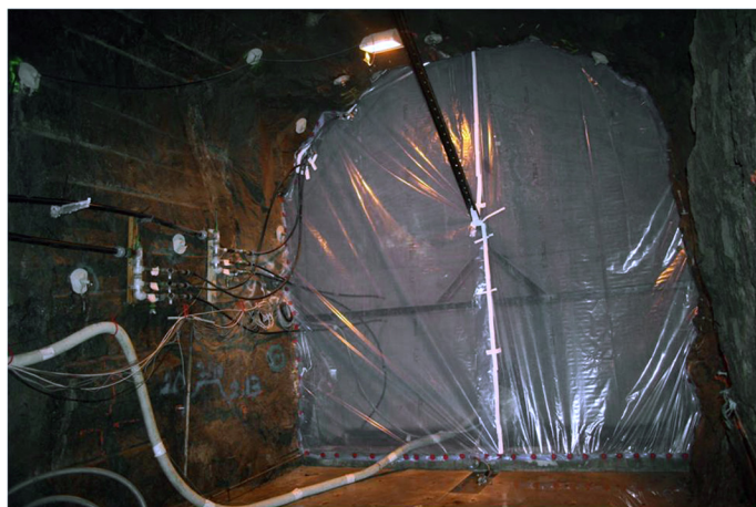
DOMPLU plug with sealed atmosphere.

The Dome Plug Experiment or DOMPLU is a full-scale deposition tunnel end plug demonstration at Äspö Hard Rock Laboratory (-450 m) lead by SKB in cooperation with Posiva. DOMPLU has been emplaced in Spring 2013 and the experimental set-up includes 45 installed sensors in the backfill, seal and filter layers and another 56 sensors in the outermost concrete dome. Cables from the inner parts of the experiment are led out through two sealed boreholes to a neighbouring tunnel 21 meters away. In a third borehole, water pipes from the specially adapted pump system are led in to the backfill and filter to enable artificial pressurizing of DOMPLU. Sensors within the plug concrete are led out the front face of the concrete dome. The properties being measured by the array of sensors include temperature, relative humidity, strains, displacements, pore pressure and total pressure. Just outside the concrete dome a watertight weir collects water for precise leakage measurements. After several months of pressurization by the groundwater and natural wetting of the bentonite seal, the artificial pressurizing could start in December 2013. The pressure is currently kept constant at 4 MPa and monitoring of